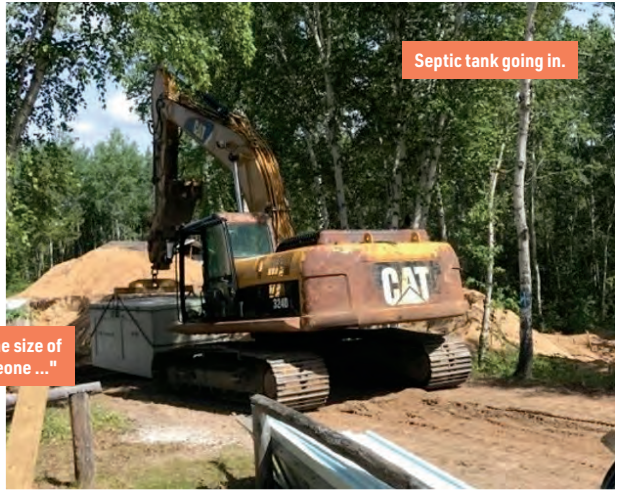
Septic tank going in.