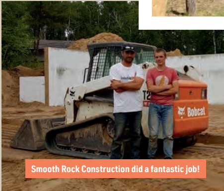
Smooth Rock Construction did a fantastic job!