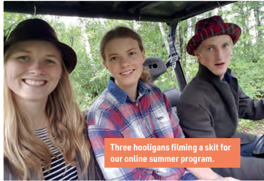
Three hooligans filming a skit for our online summer program.