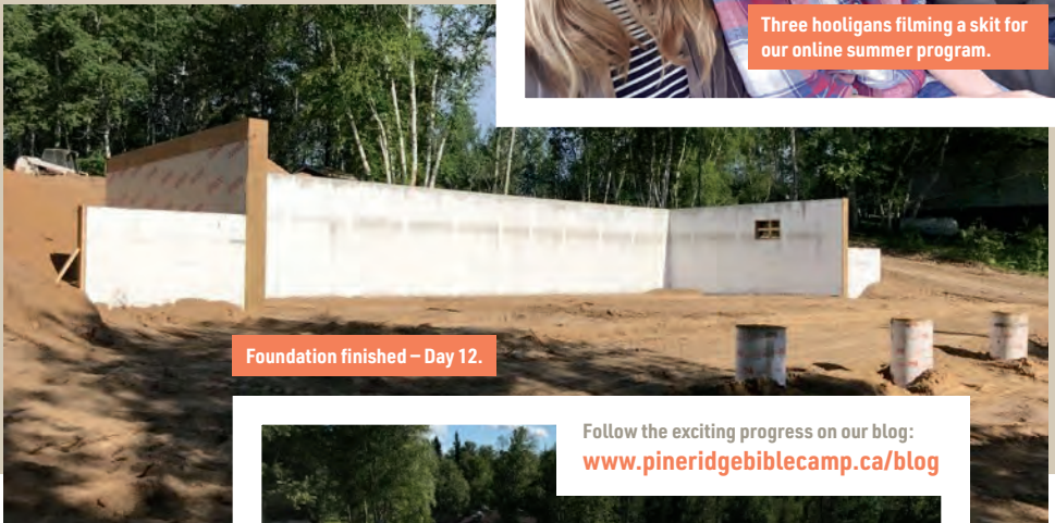
Foundation finished – Day 12.

Follow the exciting progress on our blog: www.pineridgebiblecamp.ca/blog